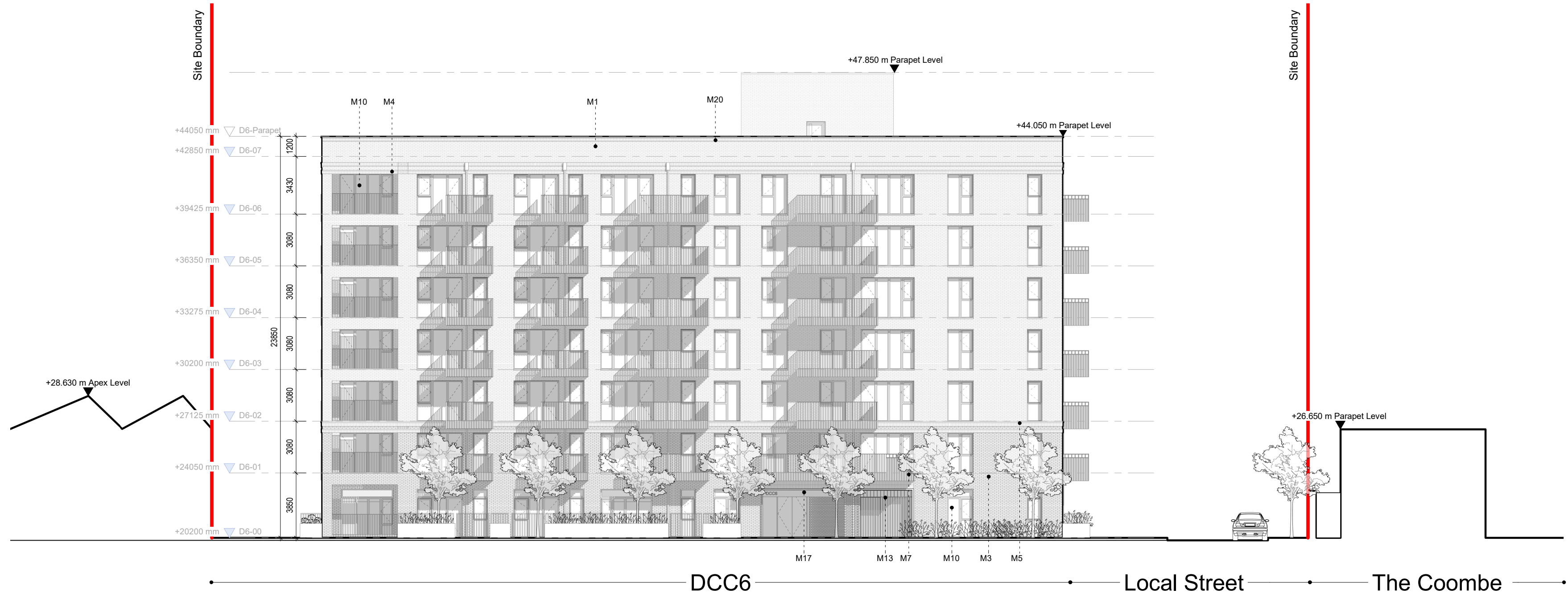
Elevation 11: DCC6 East 1 : 200