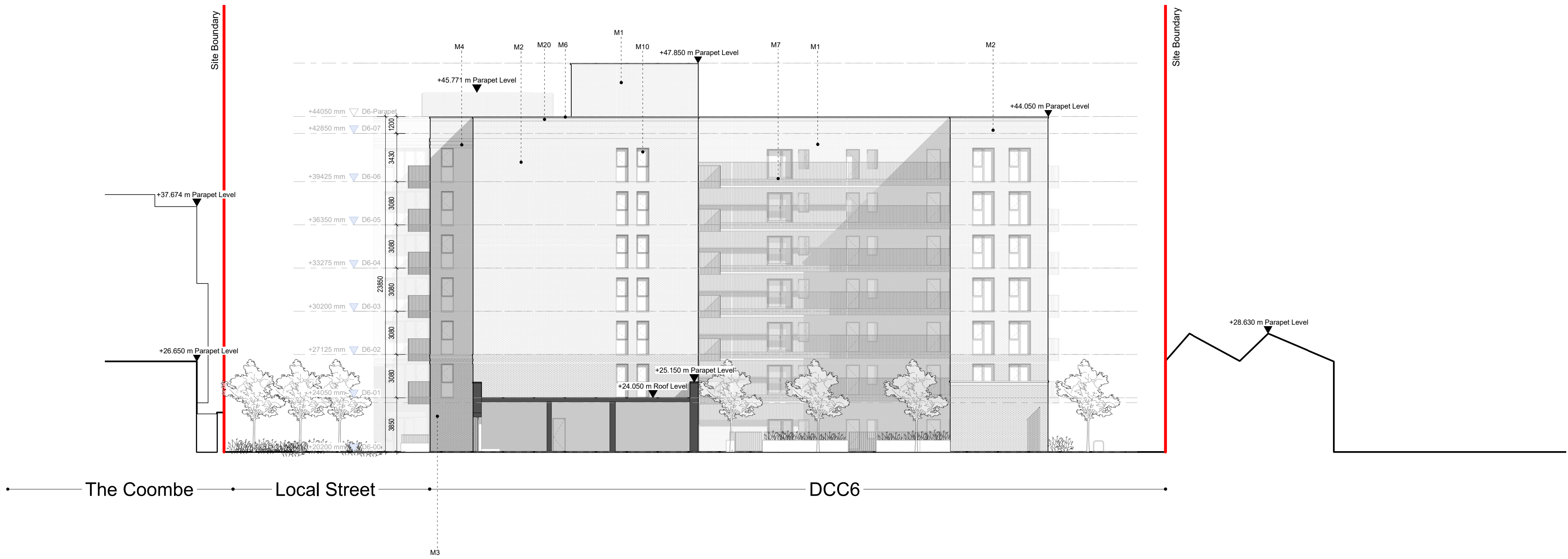
Elevation 12: DCC6 West 1 : 200